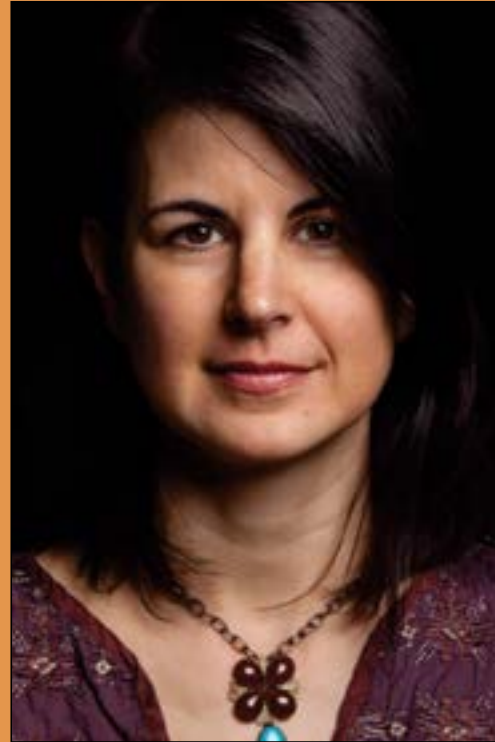
Susan de Cartier Honour Roll Award